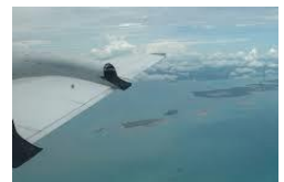
BORDER & COASTAL SURVEILLANCE